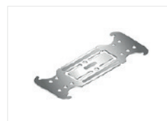
flat cross link