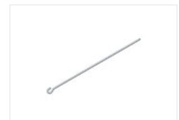
L assembly bar