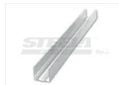
UD30 ceiling profile