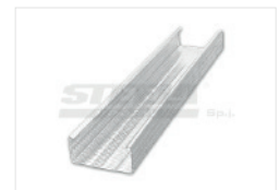
CD60 ceiling profile

The number of profiles and accessories necessary for the installation of 1 m 2 of the suspended ceiling on the steel structure.