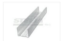
U50 Wall profile

* The maximum distance between the profiles is 800 mm. Calculations approximated to profiles with a length of 3 m. The "C" and "U" profiles should be used in the same width.