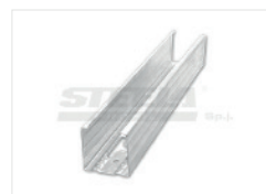
C50 Wall profile